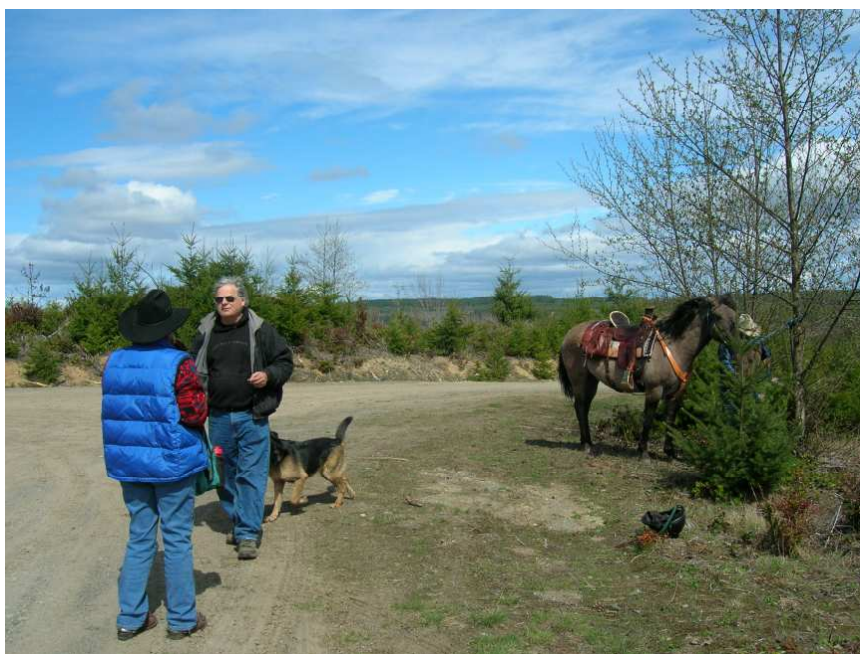
Toandos ride, April 2009

May's Chapter ride is hosted by Peninsula Chapter at Miller Peninsula. It